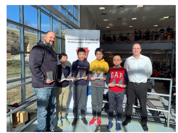
Springhouse Middle School First place team