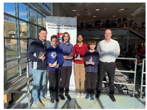
Orefield Middle School - Second place team