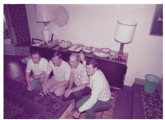
The hors d'oeuvre table

Communication with the cook was somewhat dicey. I could never get him to understand that beef does not have to be well-done, medium, or even rare was ok. I asked him to add eggs to the meatloaf. Cutting the meatloaf, a boiled egg appeared like a giant eye! He had boiled an egg and put it in the raw hamburger. My Arabic just was not good enough to explain that he was supposed to take a raw egg and blend it into the hamburger before cooking.