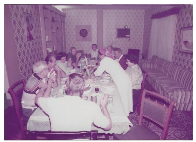
Thanksgiving dinner. Us ex-pats, our drivers, their wives, the cook's wife. I'm sitting in the front, with my back to the camera.