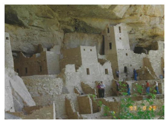
Close-up of the structures