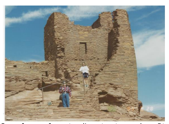
One of many free-standing structures along Rt. 160 similar to Chaco Canyon

But dinosaur tracks are not why we were there.